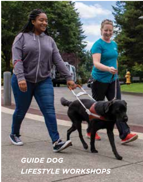
GUIDE DOG LIFESTYLE WORKSHOPS