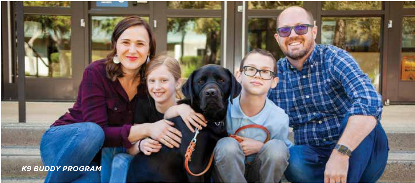
K9 BUDDY PROGRAM